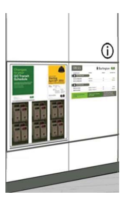
Figure F-12: Conceptual Information Module