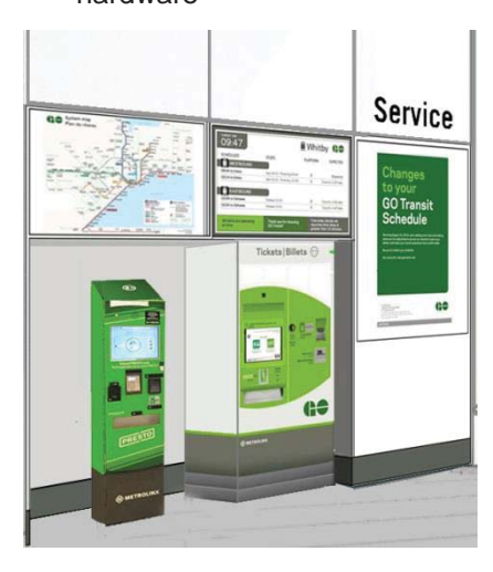
Figure F-11: Conceptual Digital Service Module

Monitor mounting bracket to be stainless steel weldment system and stainless steel hardware