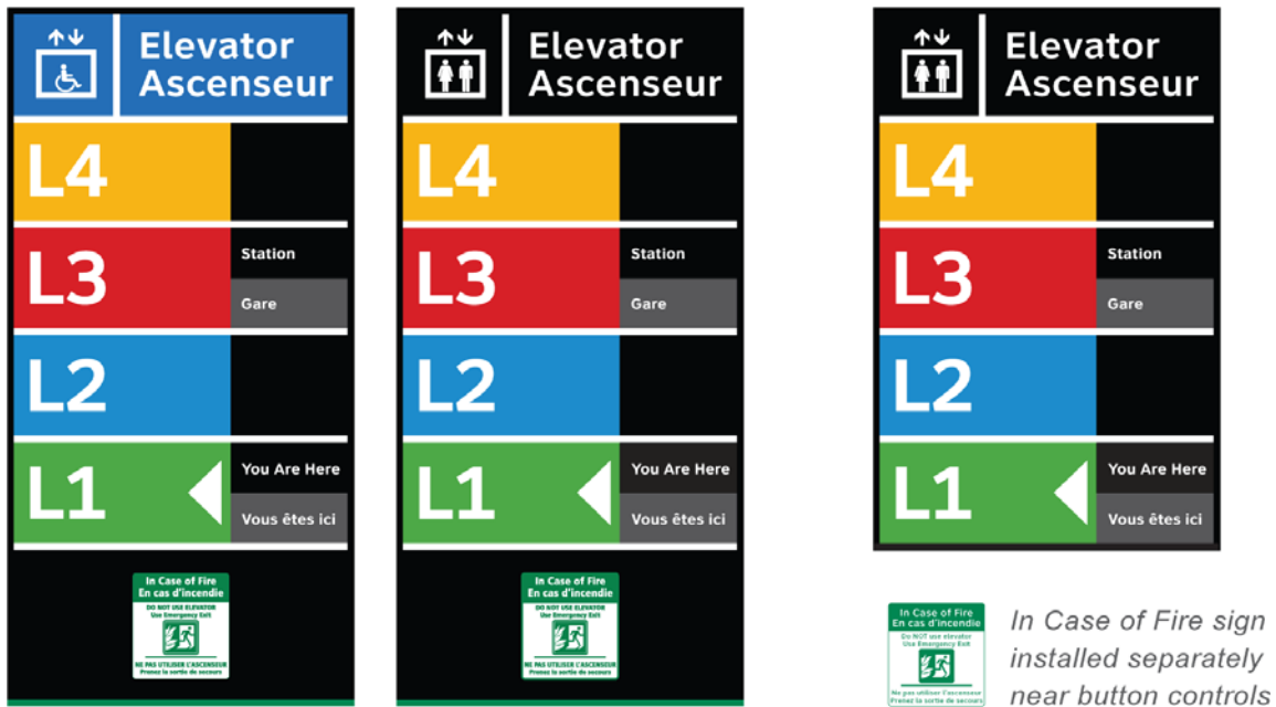
Typical Design A, Elevator Lobby Signs