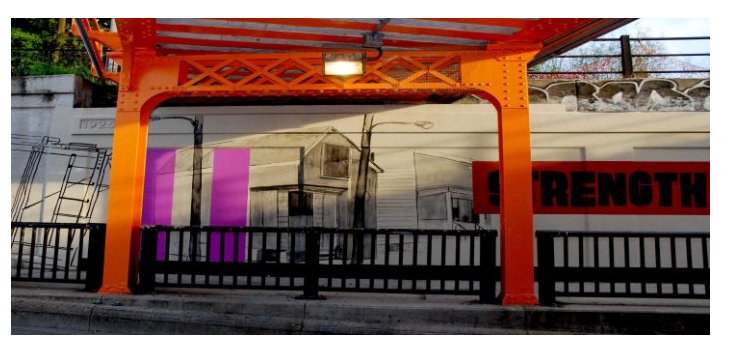
Figure 2 – Examples of Community Murals - Joe Shuster Way and Dupont Street along the Weston GO Rail Subdivision