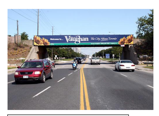
Figure 3 - BBS in the City of Vaughan

Crime Prevention Through Environmental Design (CPTED) - In addition to the ongoing inspection and abatement initiatives, RCMO and System Safety staff will initiate CPTED surveys to inventory and address locations where graffiti is most prevalent. The CPTED survey would also be used to identify or recommend enhancements that can be employed as crime prevention or other security measures. The CPTED approach provides opportunities to work closely with various community stakeholders and implement broader strategies and responses targeted at the root causes of both vandalism and graffiti.