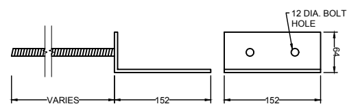
ANGLE AND ROD DETAIL