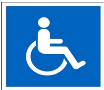
Image 14: Signs-Painted Barrier Free Parking Sign

Location: In the centre of the stall. The International Symbol of Accessibility shall be painted on the paved surface of the parking stall. Paint colour should strongly contrast with the background (paved surface), and should be repainted on a regular basis to avoid fading. They are in priority of being the closest to the elevators and stairwells.